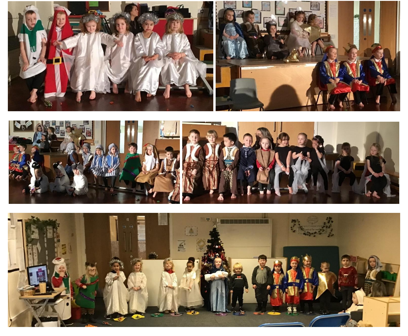
The photographs are also available on the school website.

Well done to the Reception children for their amazing singing yesterday and to Nursery children for their performances today. Thanks to the staff and children for all their hard work.