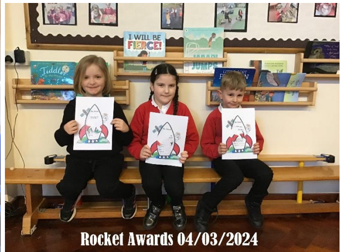
Rocket Awards 04/03/2024