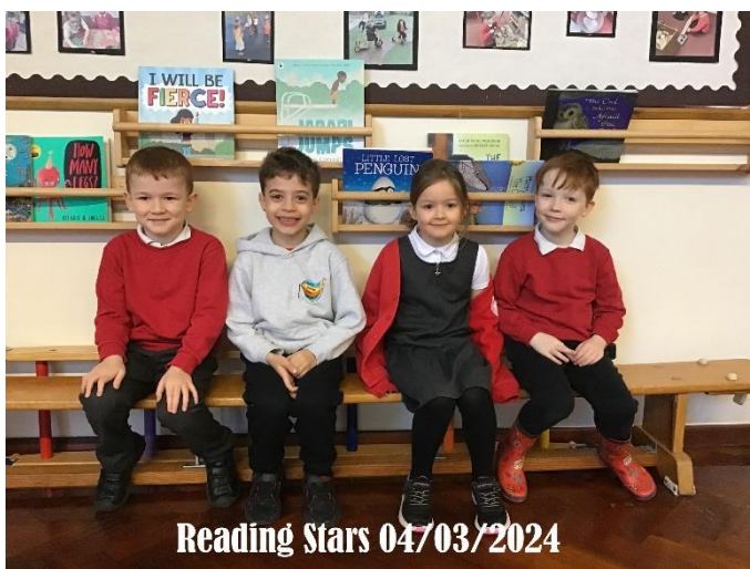
Reading Stars 04/03/2024