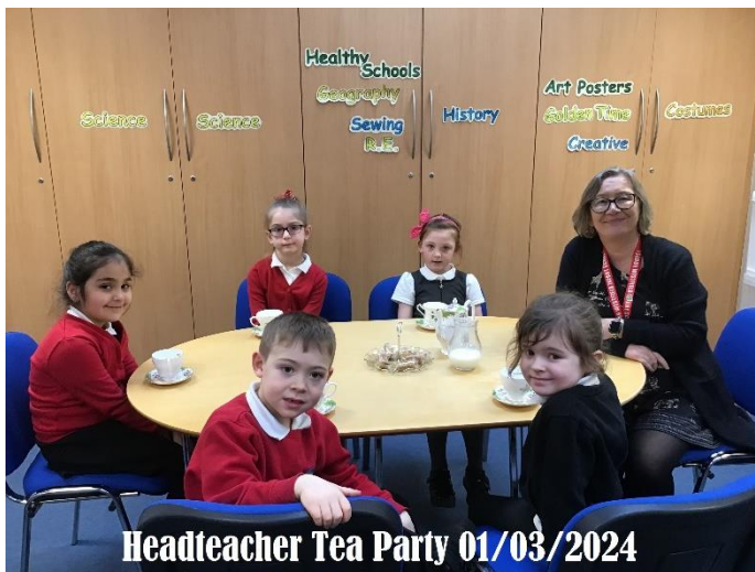
Headteacher Tea Party 01/03/2024