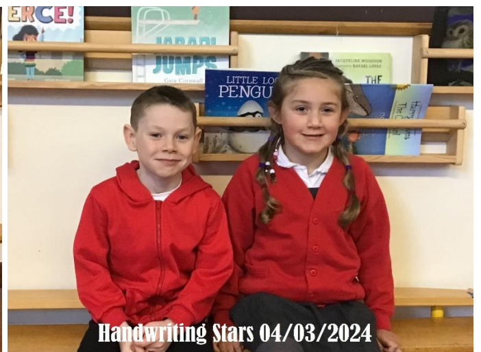
Handwriting Stars 04/03/2024

Congratulations to the children who went to the Headteacher's Tea Party on Friday and those who received awards in assembly on Monday. More photographs are available on the website