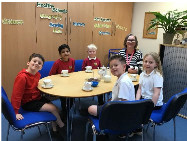
Headteacher Tea Party 07/06/2024