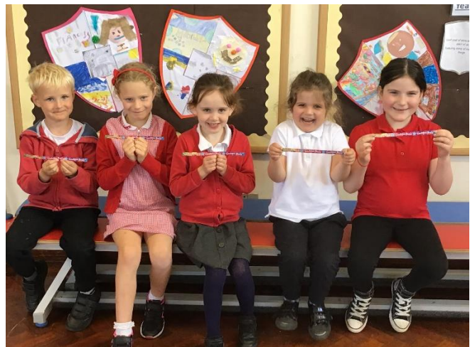
Lunchtime Stars 07/06/2024

Congratulations to the children who went to the Headteacher's Tea Party on Friday and the Lunchtime Stars from last week. More photographs are available on the website .